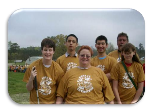
Wake County supports the first blind Envirothon Team in the nation. This team from Governor Morehead School for the blind competed in the Area IV competition.

<u>Service Learning:</u> Watershed Stewardship Award to York Elementary in Raleigh (title & engraved plaque)